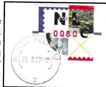
Figure 3. Nagler

In the meantime another test got underway. On 20 March 1997 a try out started with some German Nagler vending machines (Figure 3). This test period lasted until 29 September 1999.