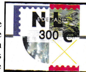
Figure 4. Hytech

Then it got quiet for almost six years. Still the Dutch Post wanted to promote customer service and wanted to try some self service kiosks again. Between 2006 and 2010 three new types of vending machines were being tested, Wincor-Nixdorf, aCon and Gunnebo. All these vending machines operated