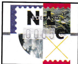
Figure 2. Frama